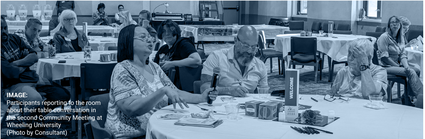
IMAGE: Participants reporting to the room about their table conversation in the second Community Meeting at Wheeling University